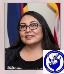
Misty Palacios Center School District